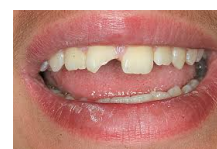
▪ Chipped tooth

If there is only a tooth "crown" broken at the gum-line or the tooth is chipped, and the root is still in the bone; it will not magically glue back together. Call a